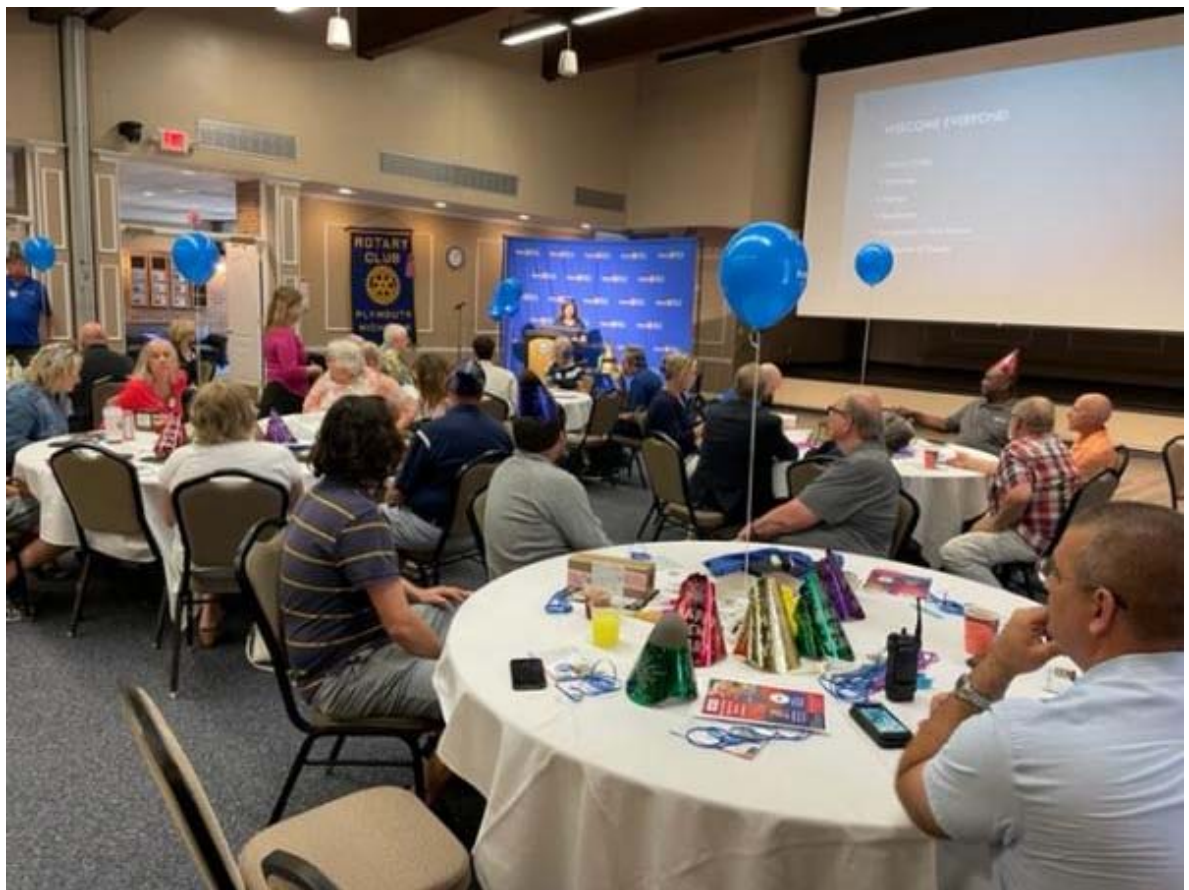
Rotary Club of Plymouth Broadcaster Friday, July 15, 2022